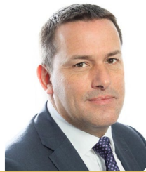
CEO & Chairman | Affidea | The Netherlands