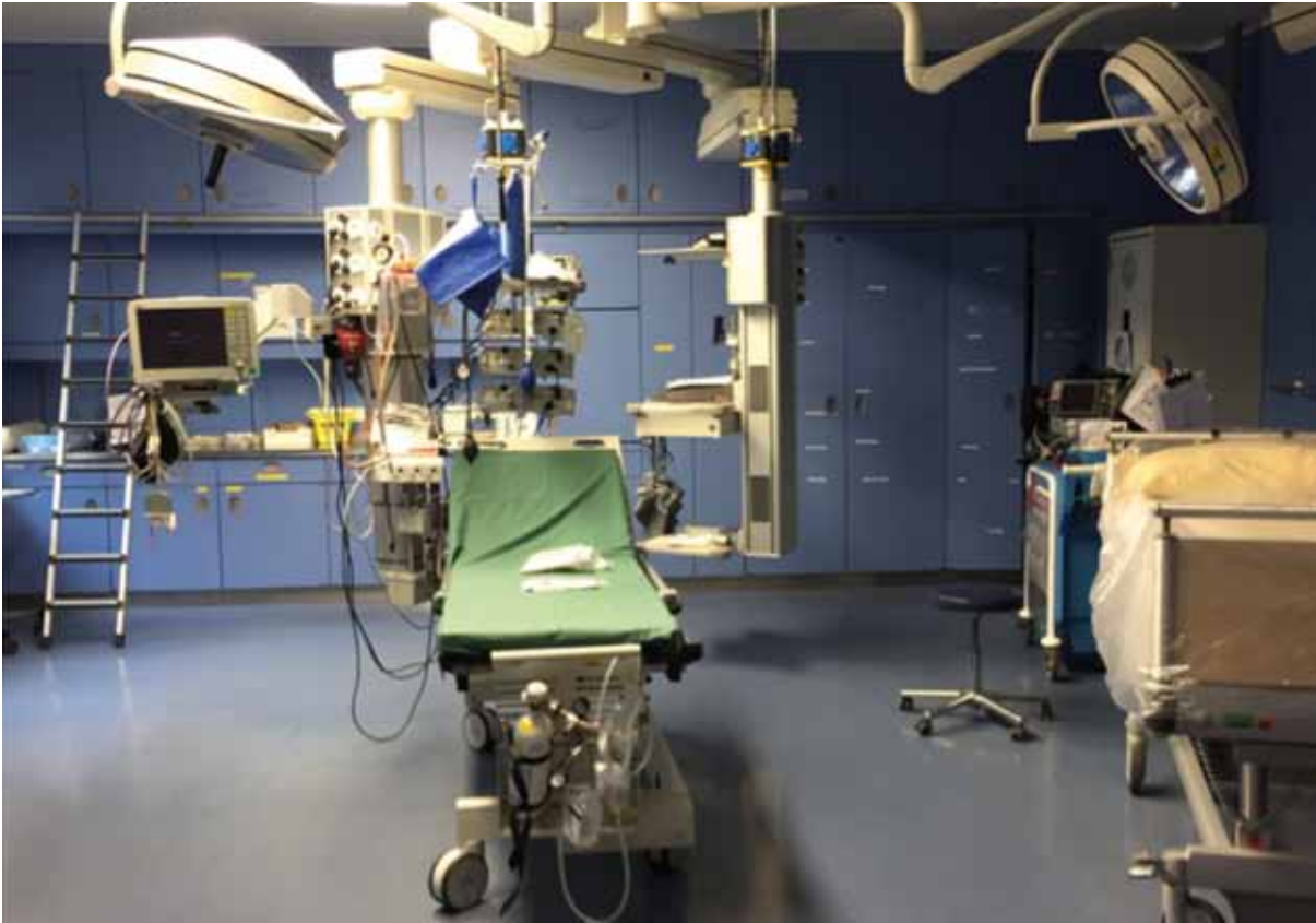
Figure 1: Typical Chest Pain Unit First Contact Room

“ CHEST PAIN UNITS (CPU) ARE SPECIALISED UNITS IN THE EMERGENCY ROOM THAT HANDLE PATIENTS WITH ALL FORMS OF ACUTE CHEST PAIN AND DISCOMFORT ”