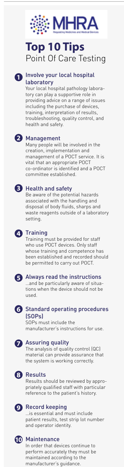
Table 1. Top 10 Tips: Point of Care Testing

© Medicines and Healthcare Products Regulatory Agency. Reproduced with permission.