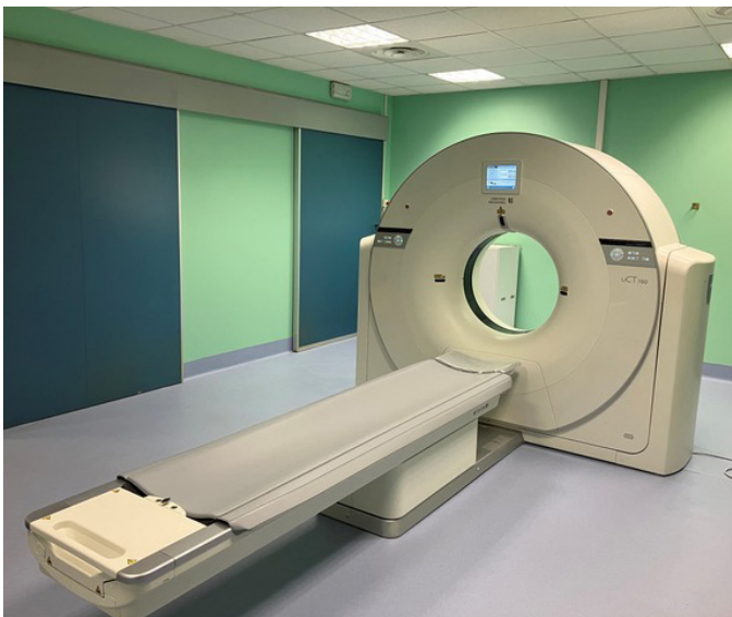
The uCT 780 CT scanner from United Imaging Healthcare installed at the Ospedale di Circolo e Fondazione Macchi di Varese

The hospital itself dates back more than 800 years - in 1173, the first hospital settlement was established in the hills of Bosto by a religious community dedicated to helping the poor and sick. Since 1995, the Circolo Hospital and Macchi Foundation has been a highly specialised hospital of national importance. Since 1975 it has been the seat of the Second Faculty of Medicine and Surgery of the University of Pavia, which was later recognised as an autonomous faculty following the creation of the University of Insubria. The main hospital building houses all clinical specialities except obstetrics and paediatrics (which are located in the nearby Del Ponte Hospital), making it a multidisciplinary treatment centre.