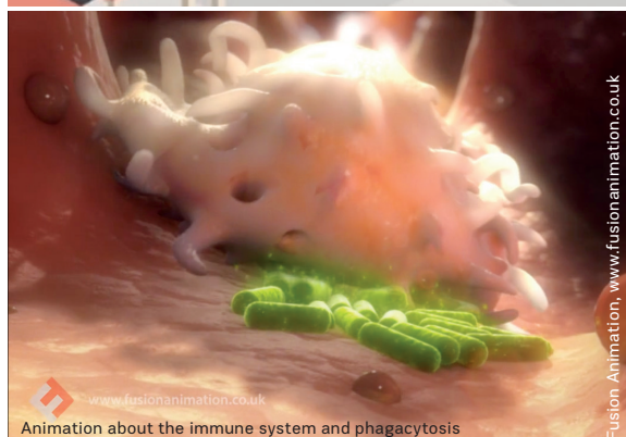
Animation about the immune system and phagocytosis

Fusion Animation, www.fusionanimation.co.uk