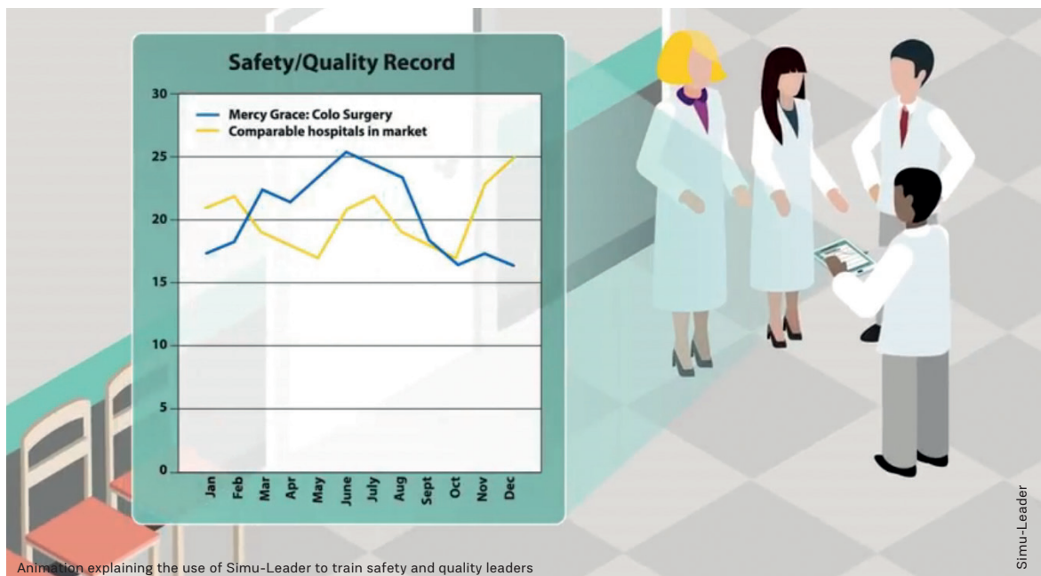
Animation explaining the use of Simu-Leader to train safety and quality leaders