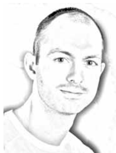
Lieuwe Bos Academic Medical Center Amsterdam, the Netherlands